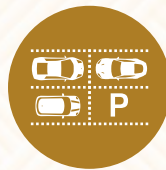
Covered Car Parking