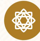
100 % Vastu Compliant