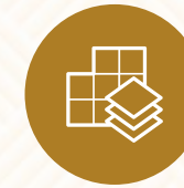
Heat Resistant Tiles in Terrace