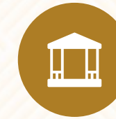
Sitting place in Terrace