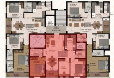
KEY PLAN - FLOOR PLAN