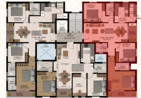
KEY PLAN - FLOOR PLAN