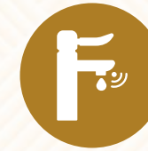
Water-Automatic Sensor System